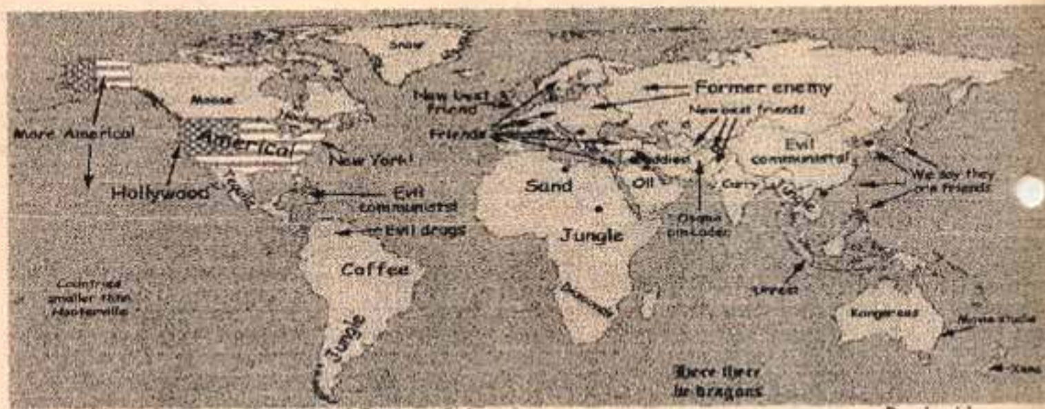
The way United States of America looks at the world

But today is well lived Makes every yesterday a dream of happiness and every tomorrow a vision of hope. Look well, therefore to this day.