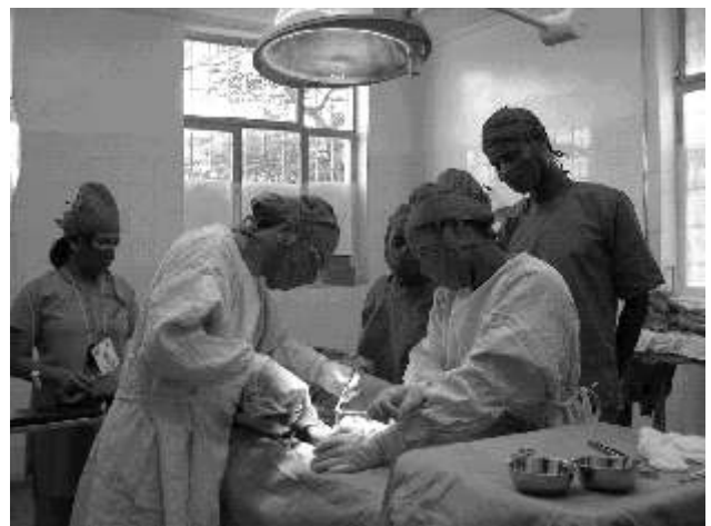
Rotarian Doctors busy on the surgery table