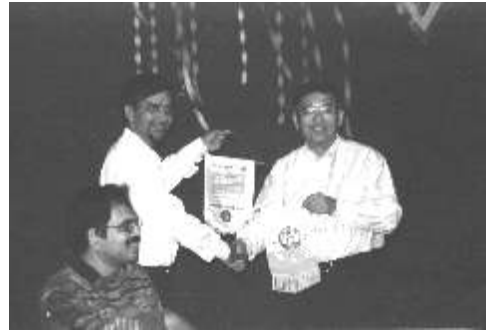
IYE In-bound Team from Malaysia - Singapore