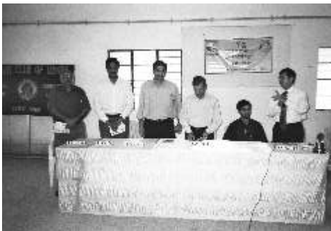
Galaxy of Governors at IYE Orientation Seminar