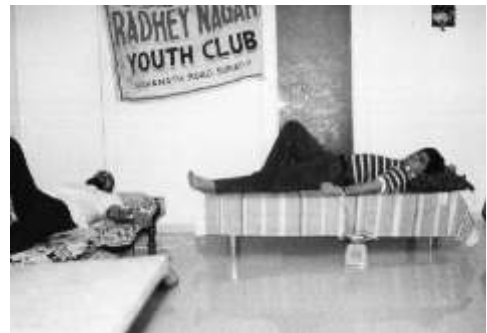
Blood Donation Camp at Radhey Nagar