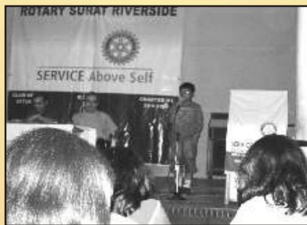
Riverside annets at their best