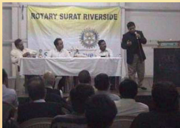
Where do we go from here?