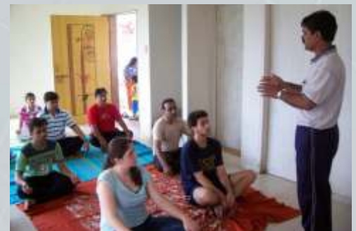
RSR members & IYE students all attentive