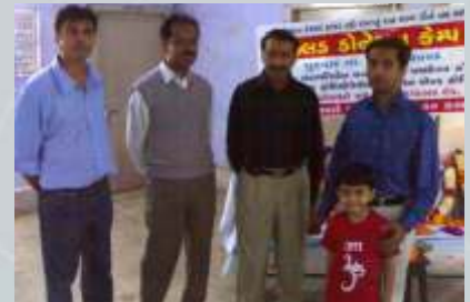
Riversiders at the blood camp